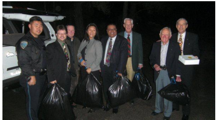
Upstanding members of Rotary delivering the gifts, or taking out the trash, or receiving a group ticket. Hard to tell. Ho ho ho!